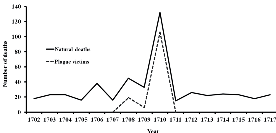
Figure 1. Number of deaths among the Jesuits (ARSI, Lithuania, nr 57)

The crisis of the traditional recruitment system made it practically impossible to offset the losses resulting from the natural deaths of older monks. The primary importance of biological factors and weather conditions are clearly evidenced by the fluctuations in the number of Jesuit deaths unrelated to the plague (Figure 1). The increased mortality in April and May should be explained by a kind of spring solstice. Changing auras negatively affected organisms weakened by the long winter. This phenomenon was further reinforced by the increased activity of the Jesuits who, around Easter time, intensively engaged in missionary work outside their religious house, travelling long distances in adverse weather conditions.